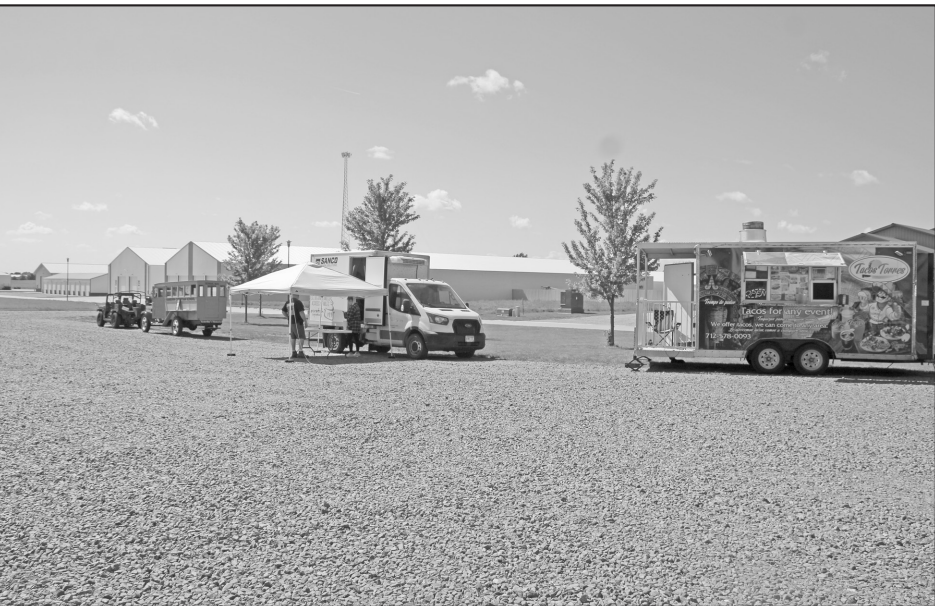
Scratch Cupcakery from Coralville and Taco Torres were available during the Touch-a-Truck Event held on Saturday.