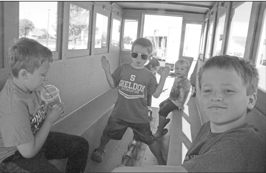
Some youngsters got to climb in the old Sanborn Christian School bus during the Touch-a-Truck Event held on Saturday morning at the Sybesma Graphics.