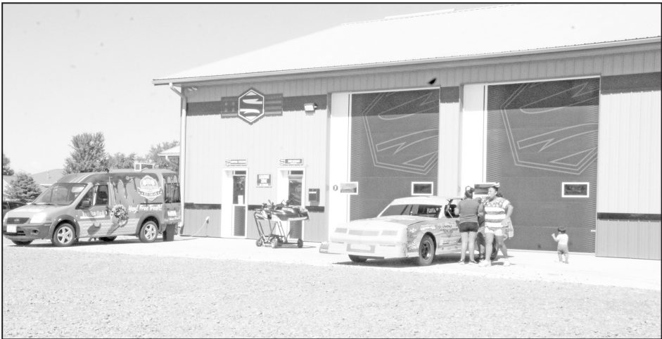
The Iowa State Bank Ice Cream truck, go-carts and a race car were available during the Touch-a-Truck Event held on Saturday.