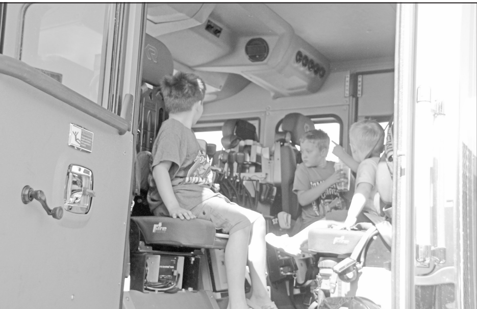
Some lucky youngsters got to ride in the fire truck back to the fire station Saturday during the Touch-a-Truck Event.